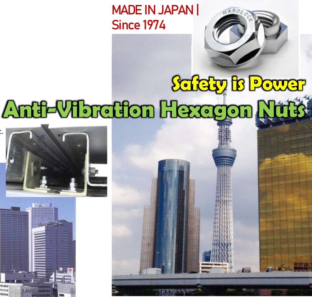
Tokyo Sky Tree