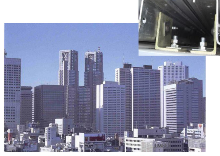
High-Rise Building Exterior Wall & Curtain Wall

High-rise Building Bonding Portion High-rise Building Ancillary Equipment High-rise Building Curtain Wall Portion Exterior Wall (Panel) Mounting Turnbuckle Dome Steel Frame Joint Stone Wall Pitching Facility Roofing Top Light Fastening Sanitation & Electrical Equipment Etc.