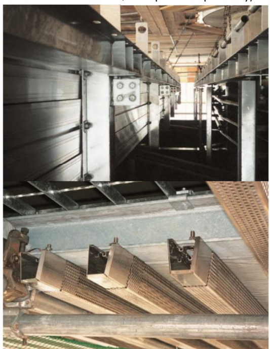
Sound – Absorbing Panels