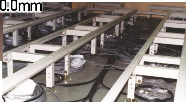
Steel Frame for Digital Equipment