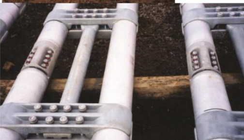
Transmission Tower Pipe Jumper

Smallest parts that require highest reliability All Grades & Surface Treatment Bore \varnothing 5 \sim \varnothing 130.0\text{mm}