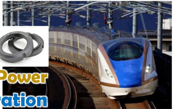
Shinkansen E7 · W7 (Bullet Train)