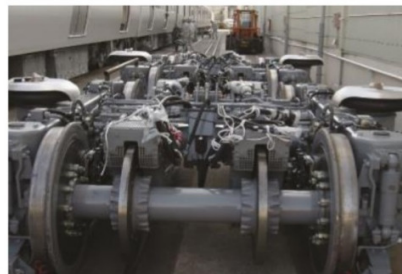
Various Mounting for Carriage Section