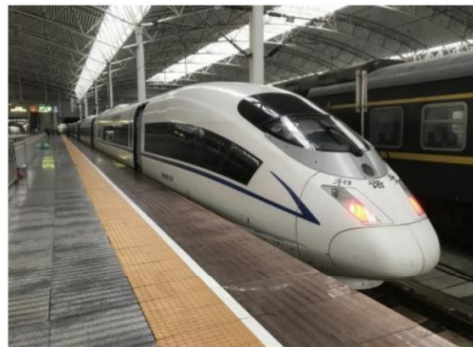
China High-speed rail CRH3 Series