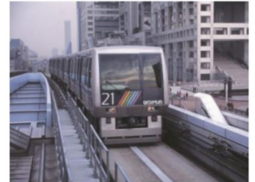
New Transport System