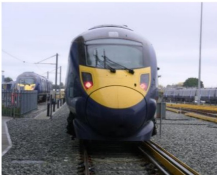
UK Express 395 Series