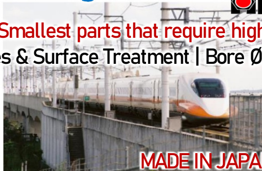
Taiwan Shinkansen 700T(Bullet Taiwan)