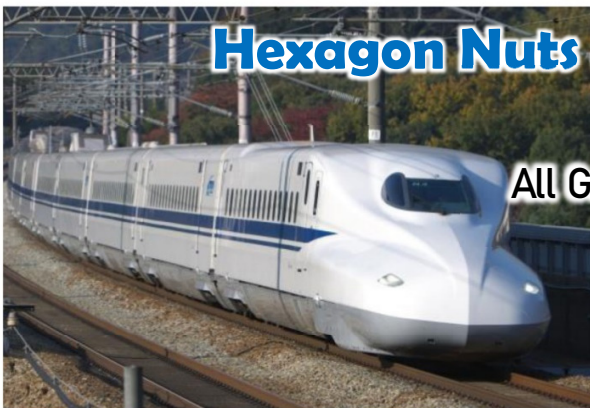
Shinkansen N700 (Bullet Train)

All Grades & Surface Treatment | Bore Ø5 ~ Ø130.0mm